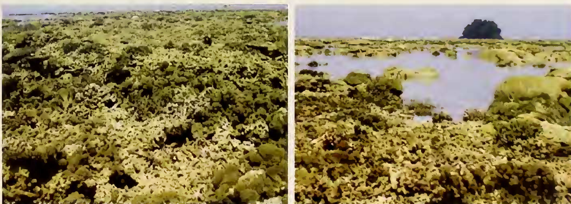
Figure 3. Uplifted reef at Pulau Bangkaru, observed on October 19, 2005.

In contrast, terrestrial observations at the islands of Baleh and Bagu, two islands which lie less than one kilometer apart from one another in the Banyak group (Fig. 1, sites 4 and 5) indicated that subsidence had occurred as a direct result of an earthquake. Terrestrial tsunami damage was highly evident. Low-lying vegetation close to the shore was brown and dead (Fig. 4a), presumably as a result of salt-water inundation and many buildings had been removed from the coastline (Fig. 4b).